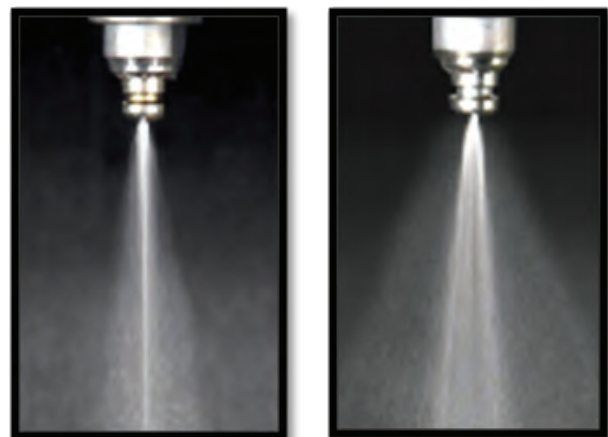
Photos of partially plugged port fuel injector (left) and properly functioning port fuel injector (right) with normal spray pattern